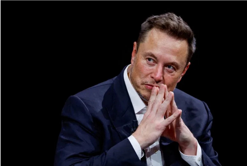
FILE PHOTO: FILE PHOTO: Tesla CEO and Twitter owner Elon Musk attends the VivaTech conference in Paris